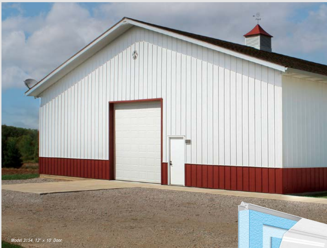
Model 3154, 12' x 10' Door