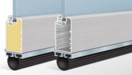
Models 905, 906