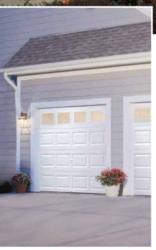
Model T42S, Short Traditional Panel with Plain Short Windows